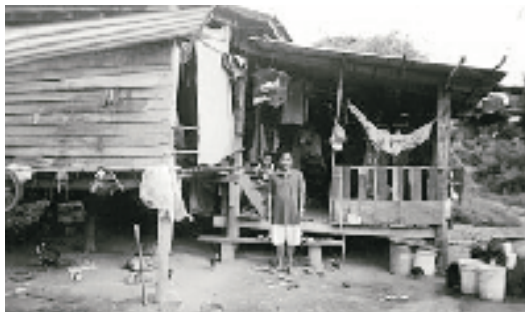
An example of poverty housing in Thailand.