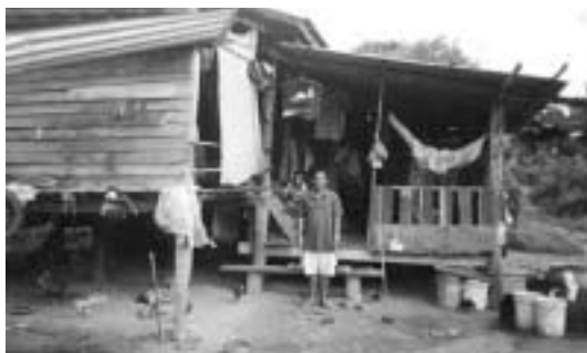
An example of poverty housing in Thailand.