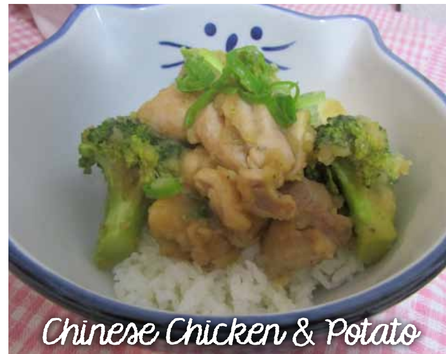
Chinese Chicken & Potato